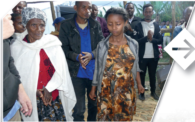
From childhood she was handicapped and lost her balance. Now she walks normal.