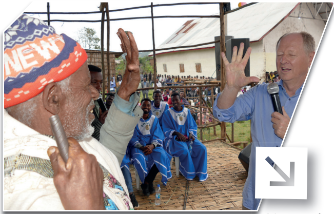
10 years he could hardly see anything. Now he can see again.