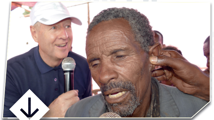
For 3 years his left ear had been deaf. He can hear again.