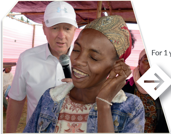
For 1 year her ear had been deaf. She can hear again.