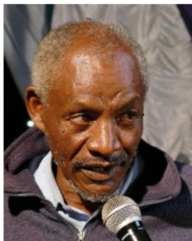
The tumour he had had in his side for three years has disappeared.