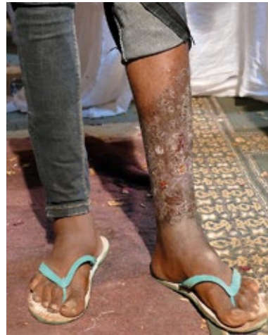
He had skin cancer and severe pain in his leg meaning he could not put weight on his foot. All the pain has gone and he can walk normally again.