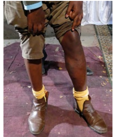
For 20 years he had had a painful, swollen leg. It caused him pain to put weight on his foot. The pain has gone and he can walk normally again.