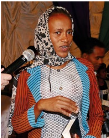
She had suffered from shoulder and back pain for 12 years. Walking was difficult. All the pain has gone.