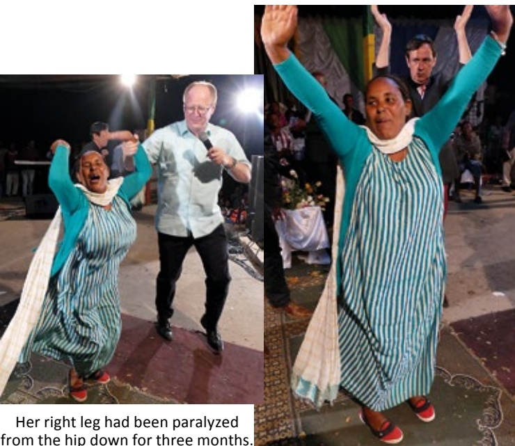
Her right leg had been paralyzed from the hip down for three months. She travelled 750km (465 miles) to receive her healing.