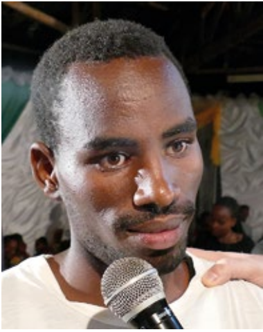
He had been unable to work for the past two weeks because of severe headaches. Healed!