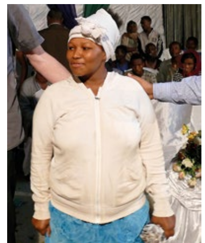
She was set free from an evil spirit.