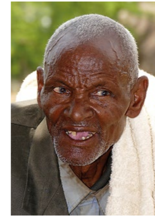
Both ears had been almost deaf and both eyes almost blind. He is delighted about his healing.