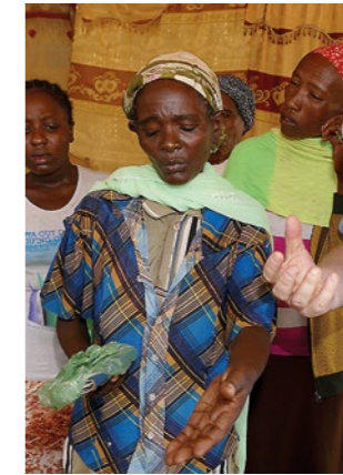
For seven years her hand had been paralyzed and she could not hold or carry anything. Now she is healed.