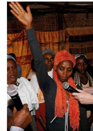
She had been unable to lift her right arm for five years because of pain in her shoulder. Now she is healed.