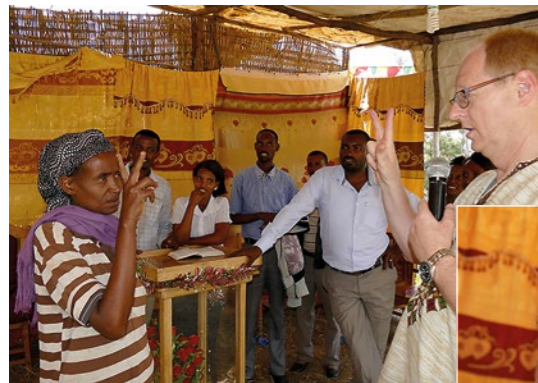
Blind for 16 years. Someone led her to the meeting and Jesus healed her eyes.