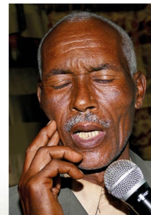
He had had a growth inside his cheek for six years. It has disappeared.