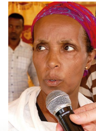
She had suffered from gastritis since childhood. She had had an operation but there was no improvement. Now she is healed.