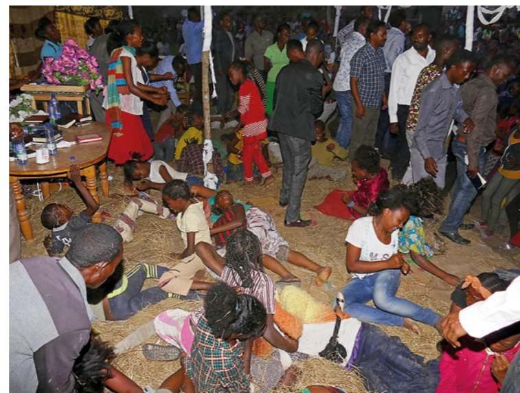
Overcome by the Holy Spirit.