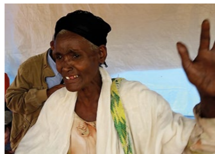
For four years she had suffered from heart, stomach and lung trouble. She could not swallow properly and bent over with pain when she walked. Here she is testifying to her healing.