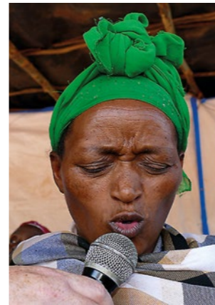
She had a growth on her hand and was short-sighted. The growth has gone and she can see well again.