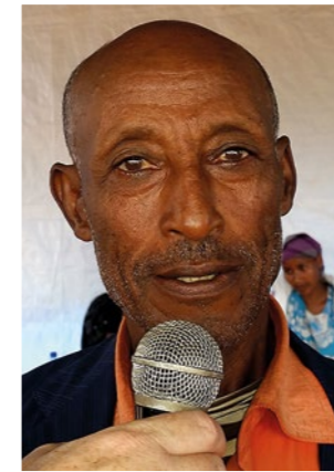
As a carpenter, he had fallen from the roof and broken his back. Since then he had suffered pain and could no longer work. All the pain left him and now he can bend down again.