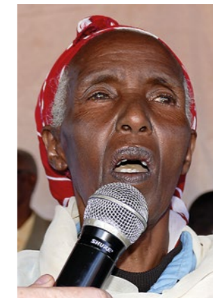
She was suffering from depression and sleep disturbances. Now it has all gone and she can sleep well again.