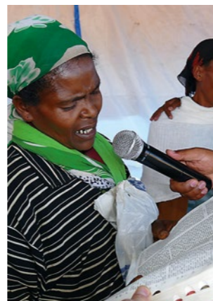
Her eyes had been so bad for the past year that she could not read anything. Now she can see clearly again.