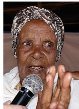
For many years she had had pain all over her body. Jesus released her from her pain.