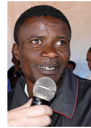
Healed of diabetes and malaria.