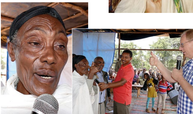
She had been blind in her right eye for two years and the other eye was also going blind. Now she can see well again.