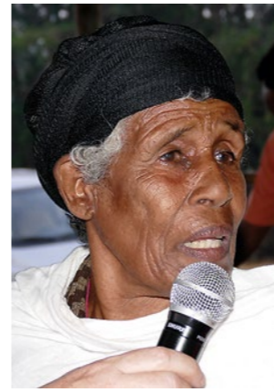
She had been almost blind for a year. Now she can see again.