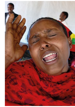
She had suffered from back pain for years. She could not bend down and walking was painful. She had been to many doctors. Now Jesus has healed her.