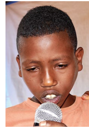
This boy had suffered from diabetes for five years. Jesus healed him.