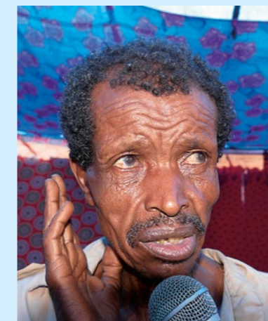
For seven years he had been deaf in both ears.