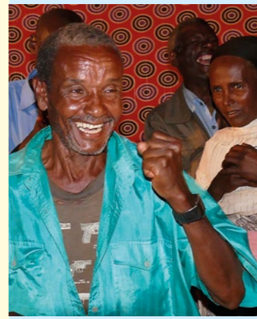
His left arm had been paralyzed for three years. Now he can rejoice over his healing.