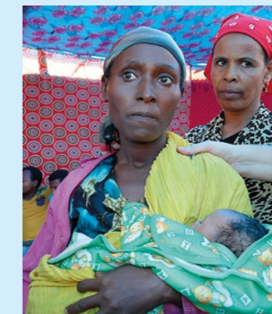
She had had constant bleeding since the birth of her baby. The doctors had been unable to help her. But Jesus could.