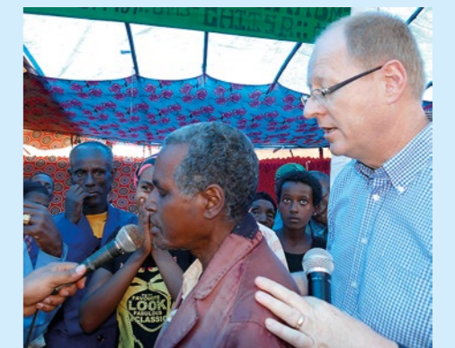
He had been completely deaf for a year. Now he can hear again.