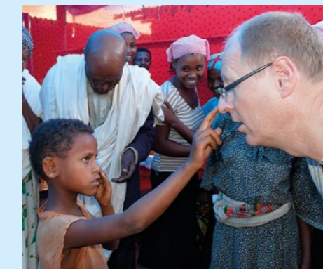
His right eye was blind. Here we are testing whether he can see.