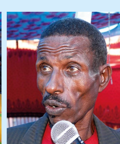
He had suffered from haemorrhoids for 33 years. When he stepped into the grounds of the event he was healed.