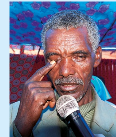
He had been blind in his left eye for seven years.