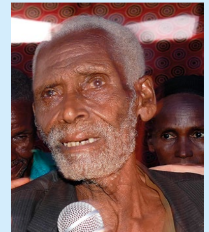
For 17 years his left eye had been blind and he could hardly hear anything. Now he can see and hear perfectly.