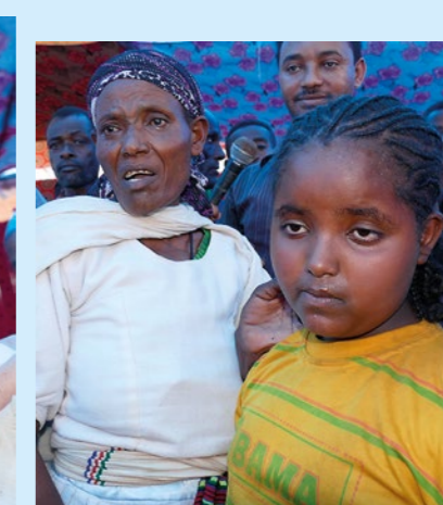
The child had been blind from birth, we were told by the grandmother. Now she can see.