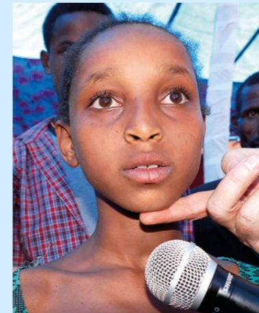
This ten-year-old girl had had a goitre that has now disappeared.