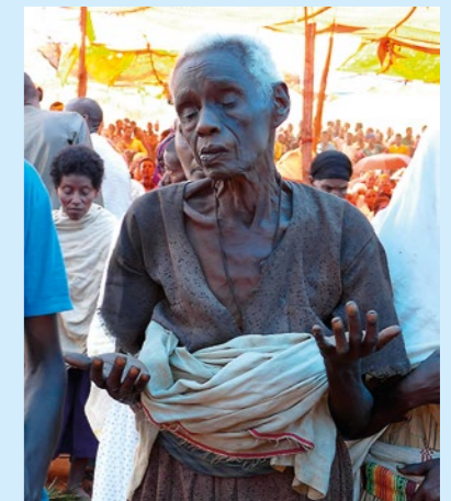
This poor lady lives on the streets and could only breathe with difficulty. Jesus healed her.