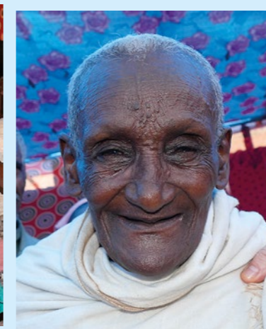
For eight years he had been almost deaf and he was blind in one eye. Now he can see and hear again.