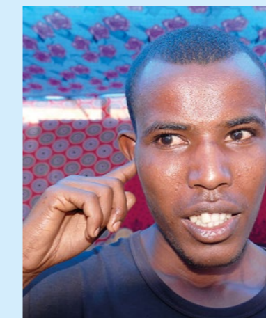
He had been deaf in his left ear for 16 years. Now he can hear in both ears again.