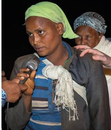
She had been suffering from constant bleeding for one year. During the prayer, she felt the bleeding stop.