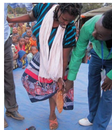
For five years, it had been painful to put weight on her foot. Now the pain has gone.