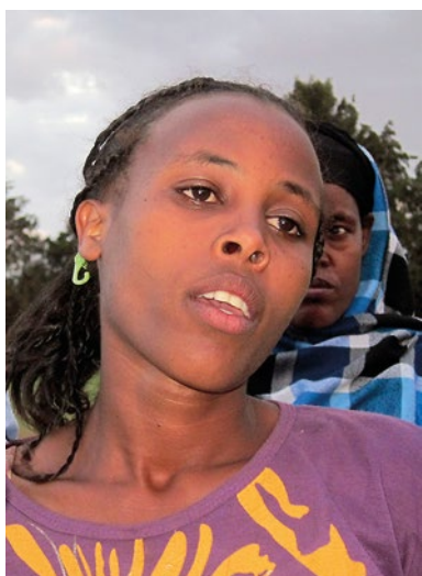
For four years, she had had a goitre the size of a fist! It has disappeared.