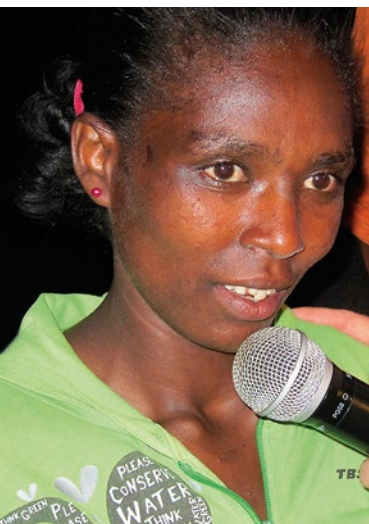
She had suffered from epilepsy since childhood. Now she has been set free!