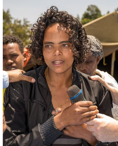
The tumour in the breast has disappeared.