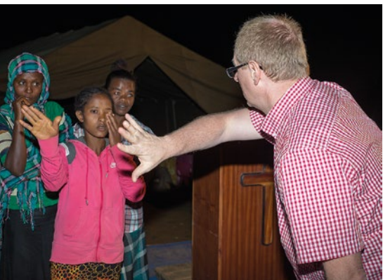
She had been blind in her right eye for three years. Now she can see.