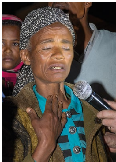
The goitre she had had for ten years has disappeared.