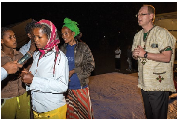
For the last five years, she had been deaf in both ears and since childhood she had suffered constant earache. Now she can hear.