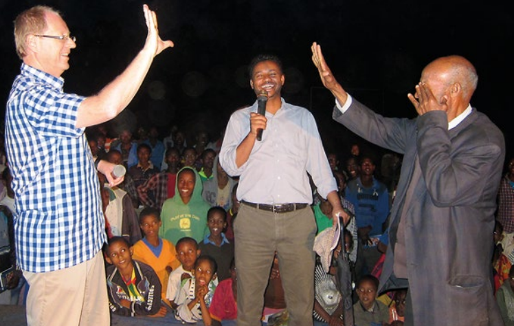
This man had been blind in his right eye for seven months. Now he can see again and we tested him.