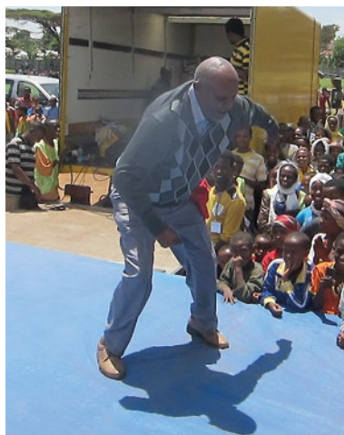
He hadn't been able to bend down for the last three years and couldn't move one of his legs properly.