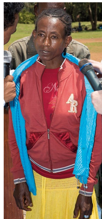
She used to squint! Now she can see normally.