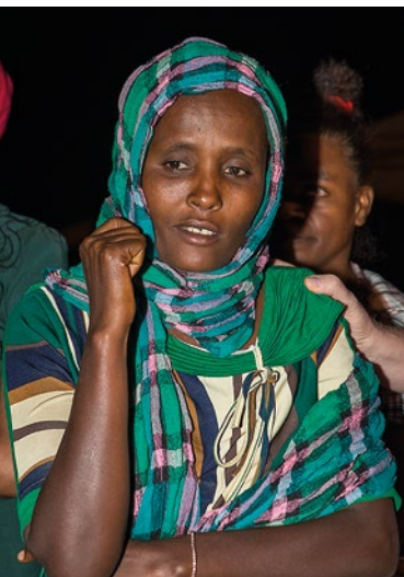
The left eye had been blind for three months.